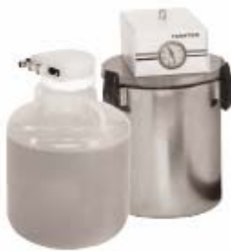
10-liter Buffer Bottle and Autotrap

Two 10-liter automated buffer supply bottles are offered. Each bottle has high and low level float control that interfaces with the Harvester 9600. These may be filled automatically from a remote source. Low air pressure (0 to 5 psi) is used to control buffer flow rate to the Harvester 9600.